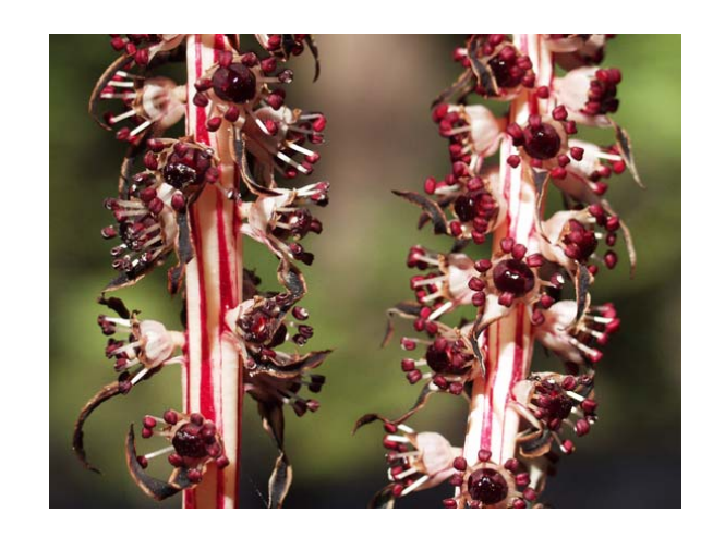
Candystick Allotropa Virgata

Indian Pipe or Ghost Plant Monotropa uniflora