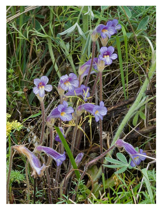
Naked broomrape Orobanchi uniflora

Agnes's talk reminded us that in a few months (depending on the weather), we'll be able to see our early wildflowers once again.