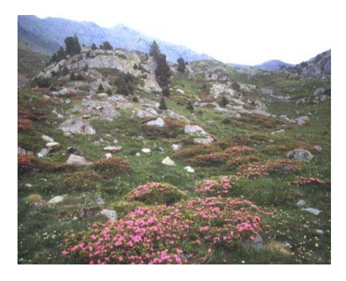
R. hirsutum is a lepidote rhododendron which originated in the European Alps, on or adjacent to limestone.

One of the first rhododendrons I wanted to see on the new HIRSUTUM Website was the rhodo the site was named after. When I typed in "hirsutum", several pictures appeared: