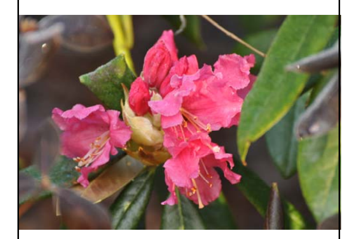
R. "Lee's Scarlet" blooming in mid-January at Glendale Gardens

A major, long planned undertaking this year saw us install micro-irrigation for about 90% of the garden. Funds we hope to receive for 2011 will enable us to complete this project. We hope to control the location of watering better, to avoid watering paths and to reduce water consumption by more than half. The volunteers are there virtually every Wednesday morning. The display in the spring and early summer is awesome. Why not come on out and enjoy your garden?