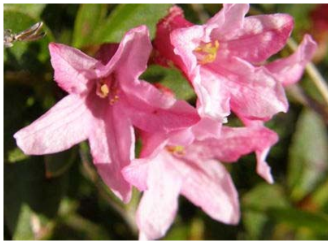
A close up picture of R. hirsutum blooms